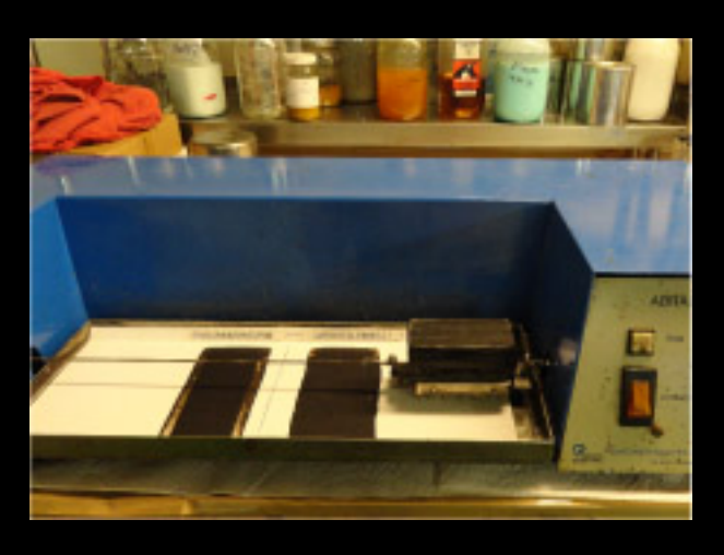
Regular Samples Testing 12 Specific Testing Standards Every Member Plant Participates